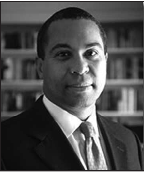
Deval Patrick, Candidate for Governor

January 19, 2006 - Radisson Hotel, Brockton