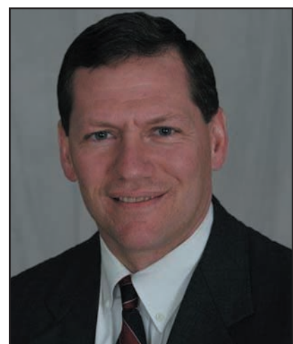
Gerry Leone of the U.S. Department of Justice

The Business Solutions Luncheon is scheduled for May 26, 2005 at the Shaw's Center from 12:00 / Noon - 1:30 pm .