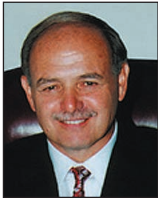
Speaker of the House, Salvatore DiMasi

The legislative edition of the Good Morning Metro South breakfast program is scheduled for Wednesday, May 11, 2005 from 7:30 to 9:15 a.m., at the Massasoit Conference Center on Crescent Street in Brockton.