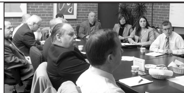
Ambassadors met recently to discuss current issues and new ways to support Chamber member businesses.

The Ambassador Team meets on a monthly basis to serve fellow members by providing information, resources, member-to-member support, increasing awareness and promoting active participation in Chamber programs and services.