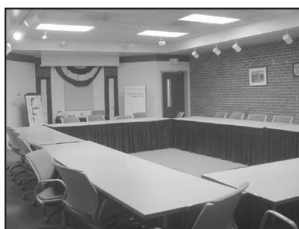
Conference space available

the Chamber at 508.586.0500 ext. 221 for more information.