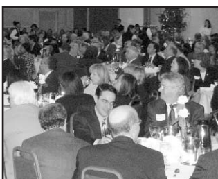
Full house of 500 greets Governor Patrick.