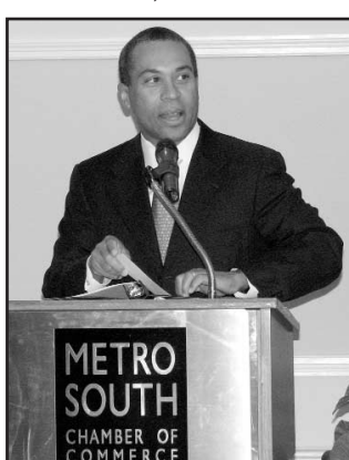
Governor Deval Patrick addresses over 500 luncheon attendees.

of urban development. Schools, transit related housing, renewable energy, health care, and economic development programs have all drawn accolades.