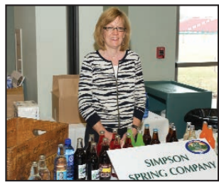
Simpson Spring Company