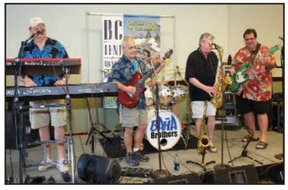
The BaHa Brothers maintained a beach party atmosphere during the event. Check out their Sandbar Grill in Taunton, visit www.bahasandbargrill.com for more information.