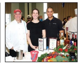
Freda's Fine Foods & Spirits