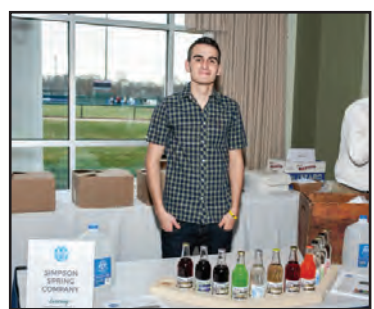
Simpson Spring Company