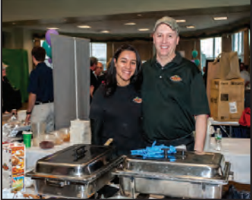
Texas Roadhouse - Brockton