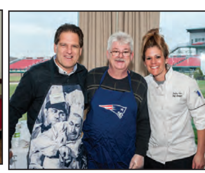
Wood Palace Kitchens hosts live cooking demonstrations at their table for attendees to observe