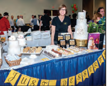
Just Desserts Bakery & Cafe