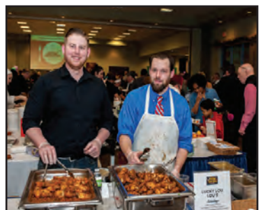
Lucky Lou Lou's