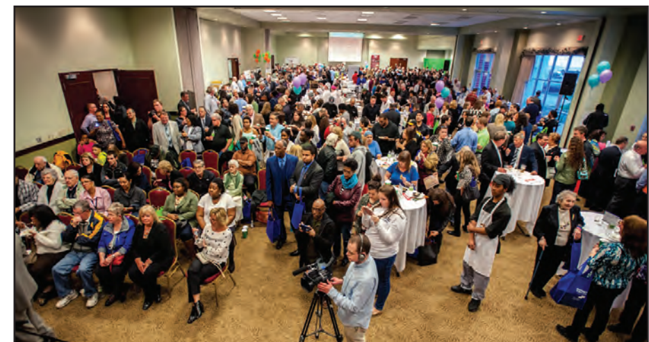
A crowd of over 500 members of the Metro South community gathered at the Shaw's Center in Brockton for the 24th Annual "A Taste of Metro South." See participating restaurants, vendors, organizations, and more at metrosouthtaste.com.