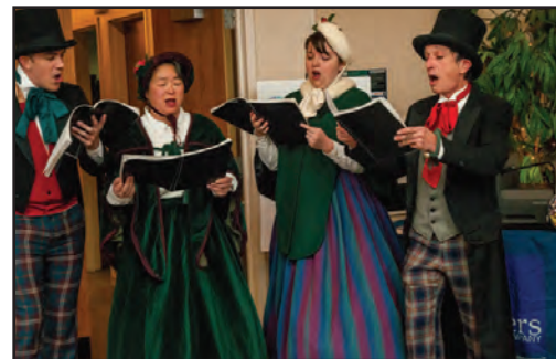
The Figgy Puddin' Carollers stroll the Expo floor singing carols and spreading holiday cheer