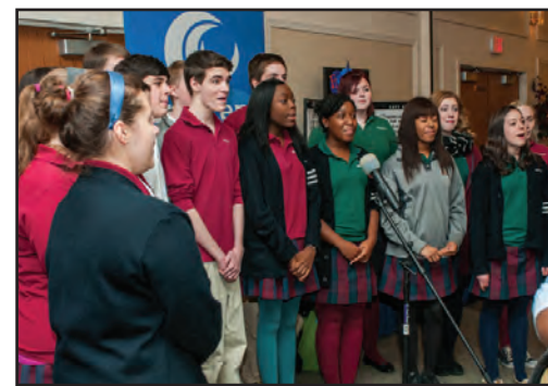
Cardinal Spellman High School a cappella group Symphonium sings the National Anthem at the start of the Annual Meeting