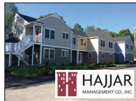
Parkside Village townhouses, located at 770 East Ashland Street in Brockton, are currently available for rent. Visit hajjarmanagement.com