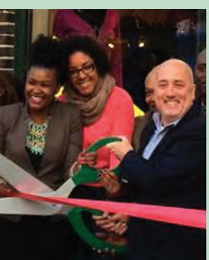
Ribbon Cutting, page 5