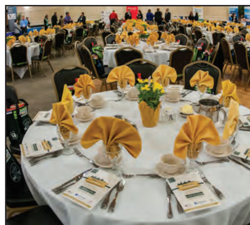
The Conference Center at Massasoit, 770 Crescent Street in Brockton, hosted over 400 business people at the sold out luncheon.