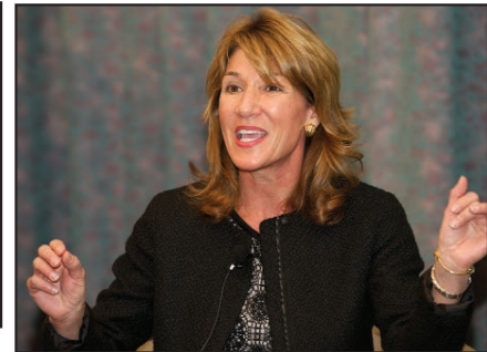
Karyn Polito, Candidate for Lt. Governor