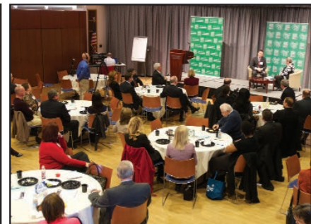
Good Morning Metro South Breakfast held at The Martin Institute at Stonehill College, a center which prepares students for leadership as active citizens. Visit www.stonehillcollege.edu .