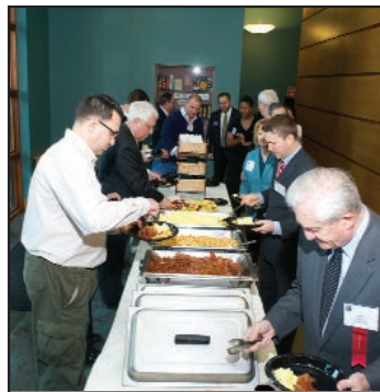
Guests enjoy breakfast catered by Sodexo