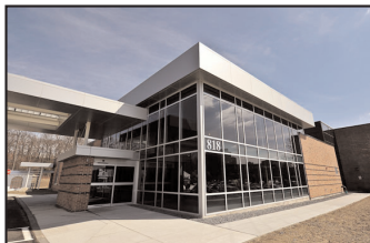
New Oncology/Radiation Therapy Center

Good Samaritan Medical Center A PARTNER TRUST • A PARTNER TRUST • A PARTNER TRUST