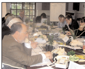
Chamber members talking with prospective members about the many benefits of Chamber membership.