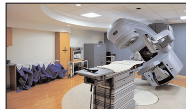
The new Linear Accelerator, used in radiation treatment