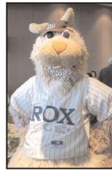
Brockton Rox Mascot K-O