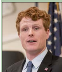
Legislative Luncheon Page 7