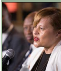
Multi-Cultural Forum Page 6

To best serve the unique interests and needs of member businesses and to champion the broader economic vitality of the Metro South region.