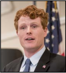
Congressman Joe Kennedy III