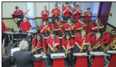
Brockton High School Jazz Band