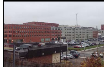
View of the Enterprise Center from the nearby train station. The next phase of development will be on the right.

The Metro South Chamber of Commerce Board of Directors recently met and approved a resolution in support of the downtown Enterprise/Trinity Block parking garage. The Governor is considering a $10 million grant toward the construction of a new 400 space parking structure on property owned by the Brockton Parking Authority and accessible from Petronelli Way. The structure will provide parking to existing properties and open up capacity for future redevelopment within the downtown and in support of near-by commuter rail service.