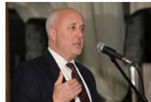
Brockton Mayor Bill Carpenter