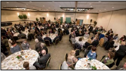
Over 200 Participants joined the Chamber to hear Congressman Kennedy