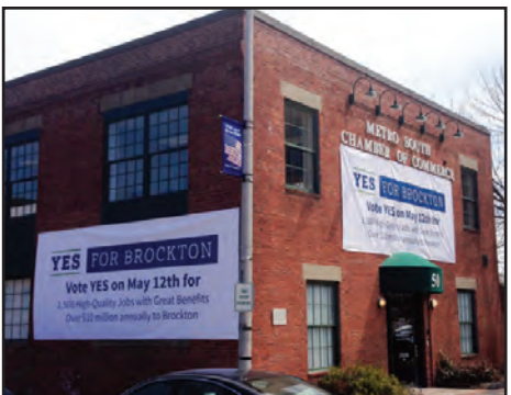
The Metro South Chamber of Commerce, located on School Street in Brockton shows support for the jobs and economic advancement that the resort casino would create in the City of Brockton