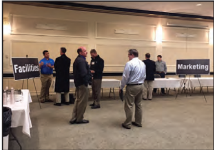
Potential vendors have the opportunity to meet with staff from Mass Gaming and ask questions specific to their business type. Categories include facilities, marketing, food, and more.