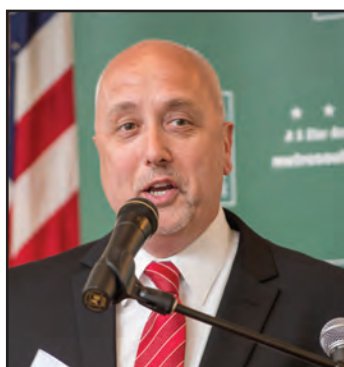
Mayor Bill Carpenter, City of Brockton