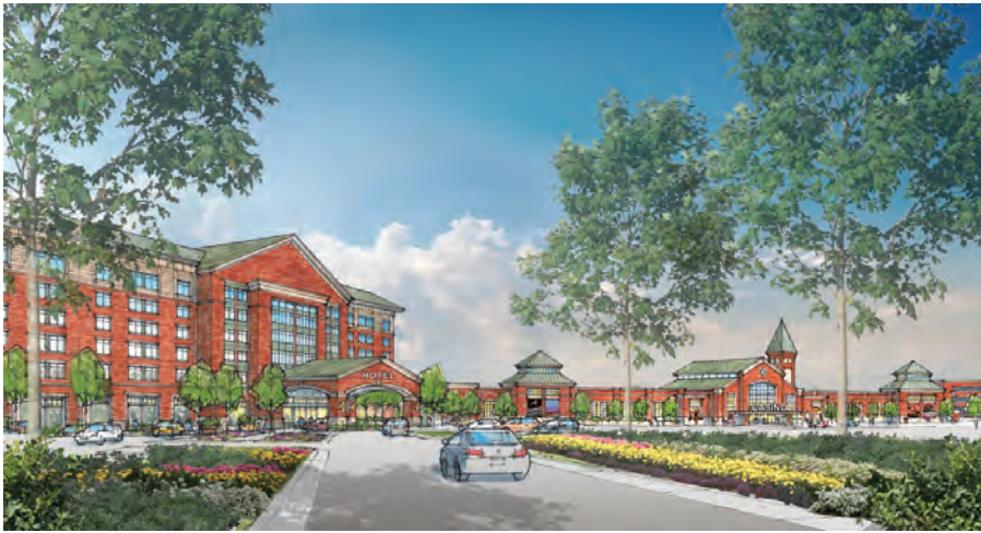
The rendering of the resort casino & entertainment destination, which will be developed on forty five acres of the Brockton Fairgrounds with a building of about 240,000 square feet.