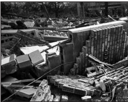
Hurricane Katrina destroyed the Mississippi Coast Chamber of Commerce

economic development of that region has been paralyzed and remains slow to recovery as local businesses and Chambers of Commerce struggle to get back on their feet. This year, the Chamber is pleased to announce that at the conclusion of the 2006 Membership Drive a donation will be made toward re-establishing Chambers in the Gulf Coast area. If you are not currently a Chamber member, take this opportunity to listen to someone who is working more intelligently through membership in the Metro South Chamber. Chamber membership is affordable no matter how small your business - 70% of our members have 10 or fewer employees - and it provides your business with tremendous opportunity.