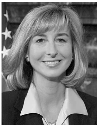
Kerry Healey, Lieutenant Governor

April 27, 2006 - Massasoit Conference Center