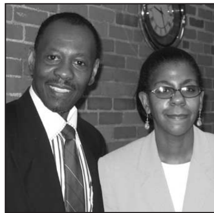
Rich Moore of SuperStar Photography and Pamela Val of Un Petit Morceau