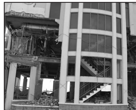
Biloxi Bay Chamber of Commerce decimated by Hurricane Katrina

Becoming a member of the Metro South Chamber of Commerce provides your business opportunities to accelerate its growth. When you join the Chamber, you become a leader within the business community and a member of the region's most dynamic advocacy organization. Membership means potential new business prospects, new savings, access to valuable resources and information, access to health and dental plans, a variety of marketing opportunities and more, for you and your business.