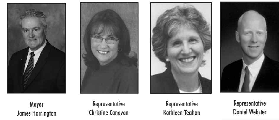
Mayor James Harrington