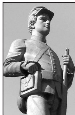
The Civil War Soldier Memorial, Perkins Park, North Main Street, Brockton