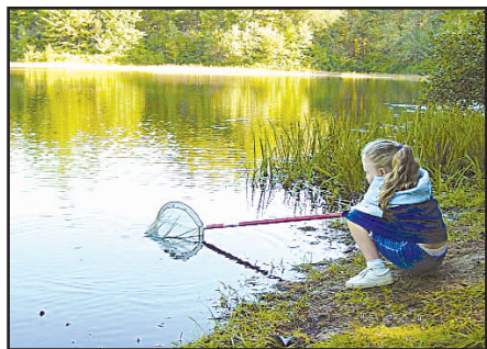
Child at Striar Pond, Halifax

Copies of the Book for Business will be distributed throughout the region to banks, real estate offices, town hall offices, all Chamber members, area colleges, and sent to all relocating businesses and families interested in the Metro South area.