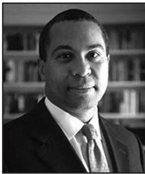
Deval Patrick, Candidate for Governor

January 19, 2006 - Radisson Hotel, Brockton