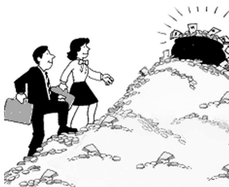
Is there a "pot of gold" in your future?

It is the dream of many to own and operate a cozy New England Inn, still others dream of having their own restaurant or tavern. And to be sure, there are thousands of highly successful inns, restaurants and taverns. But it's also a fact that they have one of the highest rates of failure of any new business. Sure, if you have prior solid experience in any business, including those mentioned, you markedly increase your chances of success. Still, it is dangerous to enter a field solely because you think it would be (choose one: fun, exciting, rewarding, easy or just plain "nice")