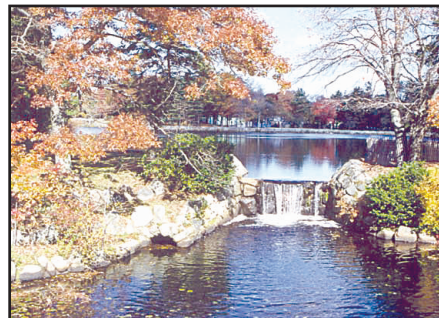
D.W. Field Park, Brockton