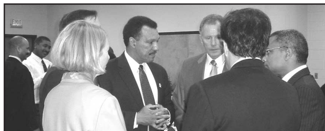
Meeting participants engage in discussion

Massachusetts to build support for investment in the archipelago's information and communication technology sectors, and to promote his "cyber-island" concept. As part of his visit, Bridgewater State College hosted a meeting for investors, area civic and business leaders, and representatives from the World Bank.