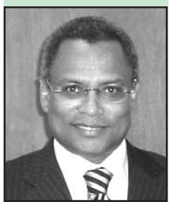
Prime Minister Neves, page 9