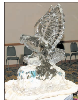
Eagle Ice Sculpture