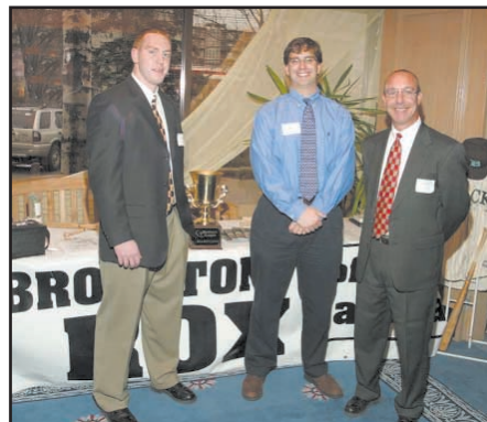
The Brockton Rox participate as exhibitors at the Annual Meeting & Business-to-Business Expo