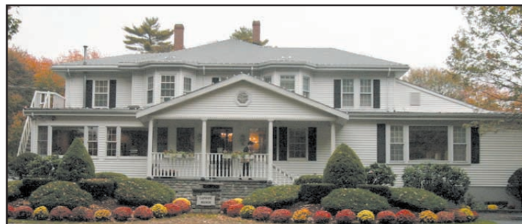
Sapphire Manor Inn on Lake Massapoag in Sharon features space for 300