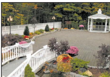
The grounds at Sapphire Manor