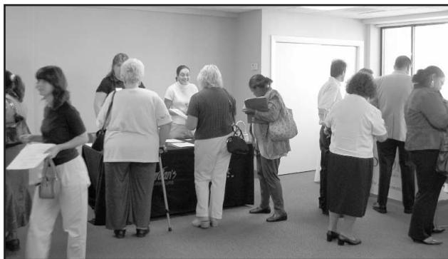
Job seekers attend a Job Fair on "Jobs First Day" at CareerWorks

In addition to the Job Fair was a Community Resources Expo. Ten organizations participated in spreading the news of their services. Those organizations were very positive regarding the participants they saw and number that actually went to the Expo