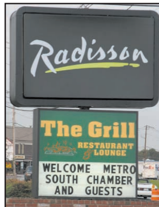
The Grand Opening of the newly renovated Radisson and Grill Restaurant