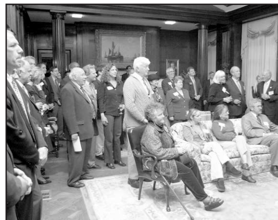
Attendees gathered in Donahue Hall at Stonehill College