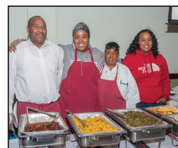
Lady C&J Souffood & Catering