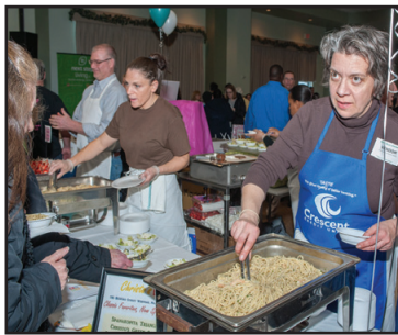
Christo's To Go