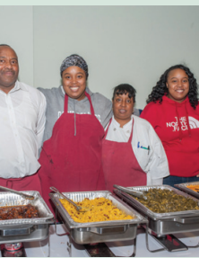
Lady C&J Soulfood & Catering at "A Taste of Metro South" page 6

To best serve the unique interests and needs of member businesses and to champion the broader economic vitality of the Metro South region.