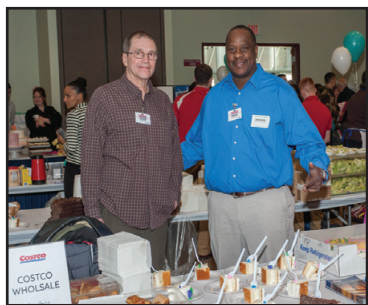
Costco Wholesale - Avon