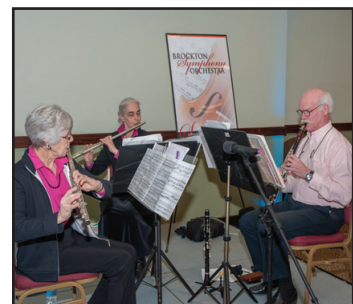
Brockton Symphony Orchestra