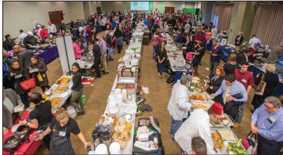
A crowd of over 500 members of the Metro South community gathered at the Shaw's Center in Brockton for the 23rd Annual "A Taste of Metro South." See participating restaurants, vendors, organizations, and more at metrosouthtaste.com .