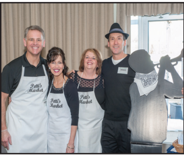
C.M. Petti Market & Deli