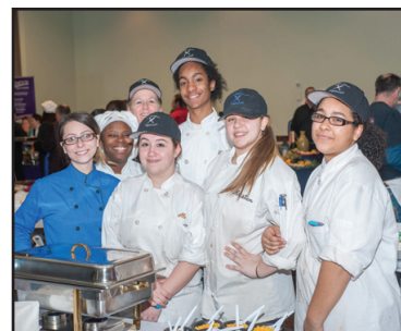
South Eastern Regional Vocational Tech. HS