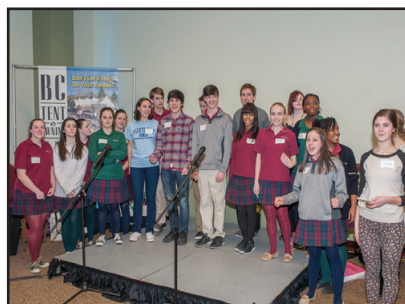
Cardinal Spellman's acapella group Symphonium