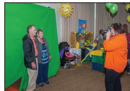
FUN Enterprises, Inc. takes photos of guests in front of a green screen, putting them on the cover of a food magazine! (shown right)

Thank you to our media partners, Brockton Community Access Channel, Rich Morgan Photography, Rob Peters Entertainment, WVBF 1530 AM Radio, and Boston MassPass.