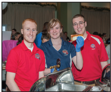
Brockton Rox Hot Dog Stand