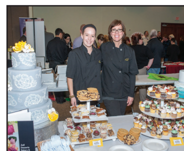
Just Desserts Bakery & Cafe