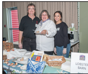
The Lobster Barn