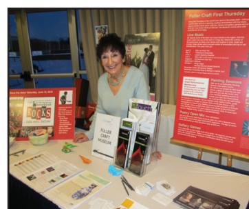
Fuller Craft Museum