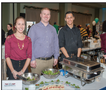
Bertucci's Restaurant - Brockton