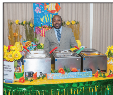
Paradise Caribbean Restaurant