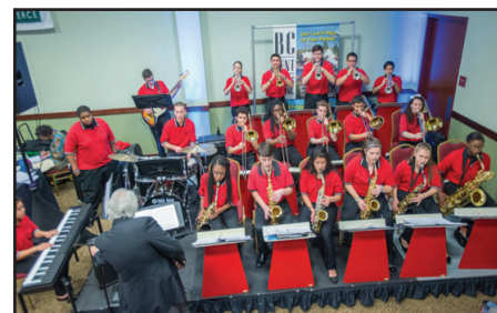
Brockton High School Jazz Band