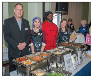
St. Joseph Manor