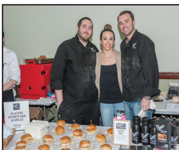
Players Sports Bar & Grille