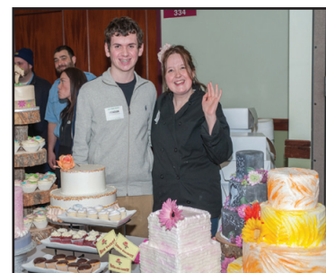
Cake in a Box