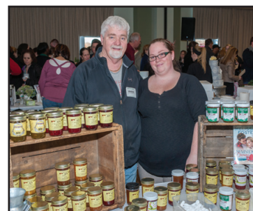
Al's Backwoods Berrie Co.