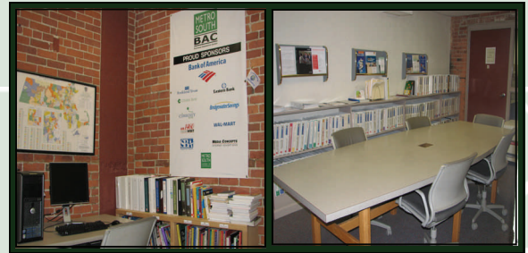
Small Business Counseling Room