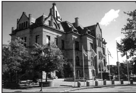
Brockton City Hall, 45 School Street, Brockton