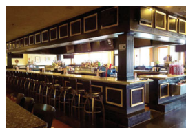
Tommy Doyle's Pub & Grill at Sidelines

To register, visit gbyp-fallmixer.eventbrite.com or email gbyp@metrosouthchamber.com . For more information on GBYP or to join the mailing list, visit www.metroouthchamber.com/gbyp .