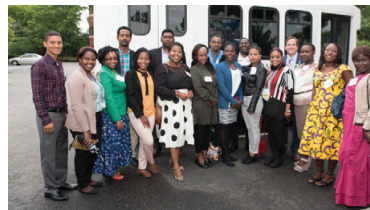
The Metro South Chamber of Commerce and Victory Human Services welcomed Bridgewater State University Mandela Fellows, twenty-five of Africa's brightest emerging public administrators.