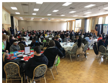
Full room of potential STEM students at BSU.