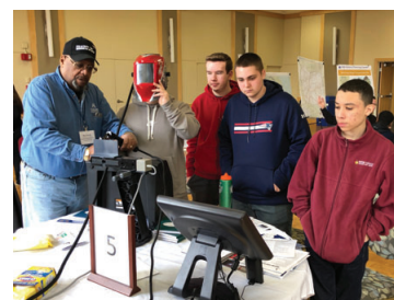
Virtual welding at STEM Career Day at BSU.