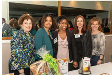
Premier Sponsor: Mutual Bank