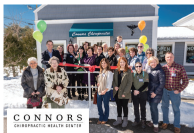
Connors Chiropractic Health Center Ribbon Cutting/Open House

The Chamber welcomed new members Connors Chiropractic Health Center with a Ribbon Cutting during their Open House last month where they offered tours of their facility with brand new equipment.