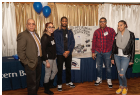
Cape Verdean Association of Brockton