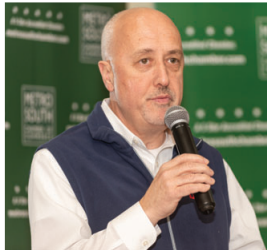
Mayor Bill Carpenter, City of Brockton

To see more photos from this event, visit flickr.com/metrosouthchamber .