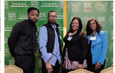
Our 2019 Women & Minority Owned Business Panel