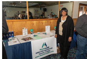
MassHire Greater Brockton Career Center