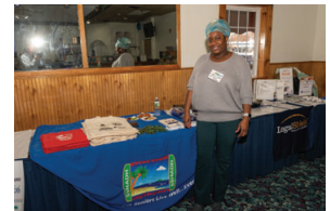
The Mentor Network/South Shore Haitian ADH