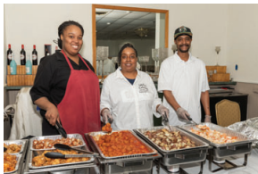
Lady C&J Catering Soulfood & Catering