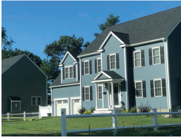
New Linwood Street Homes, under construction.