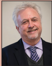
Richard Hooke Crescent Credit Union Page 8