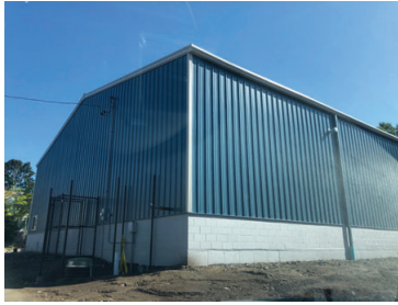
Atlantic Shipping, New Building in Brockton.