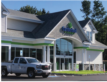
Cumberland Farms expands on Belmont Street.