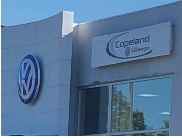
Copeland adds Volkswagen to Toyota and Chevrolet Dealerships in Brockton.