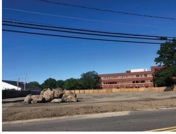
Volkswagen expansion on Liberty Street.