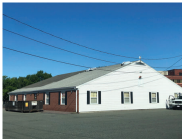
Fronto King moves to Brockton, expands already.