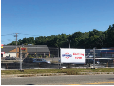
Irving, coming to Pleasant Street, Brockton.