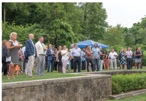
Metro South Chamber and community members enjoy the picturesque Queset Garden at Crescent Credit Union's Midsummer's Night in the Garden II, Easton.