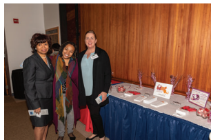
Polished on Purpose & Family and Community Resources.