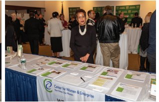
Center for Women & Enterprise.