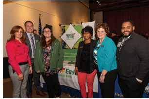
Premier Event Sponsor: North Easton Savings Bank

Visit flickr.com/metrosouthchamber to view more from this event.