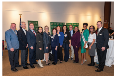
Representatives from U.S. Small Business Administration, SCORE Business Counselors, Massachusetts Office of Business Development (MOBD); and the 5th Annual Multicultural Woman & Minority Owned Business Panel at Fuller Craft Museum on March 5, 2020.

Over 200 community members gathered at Fuller Craft Museum last week for the Metro South Chamber's 5th Annual Multicultural Business Forum, featuring a business resource expo and woman & minority owned business panel. The event was sponsored by North Easton Savings Bank.