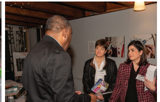
Old Colony YMCA.