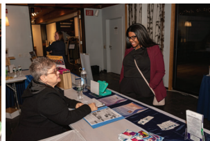
South Shore Women's Business Network (SSWBN).