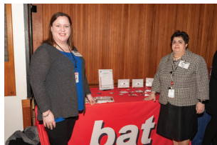
Brockton Area Transit Authority (BAT).