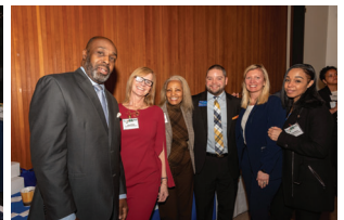
Rockland Trust Company.